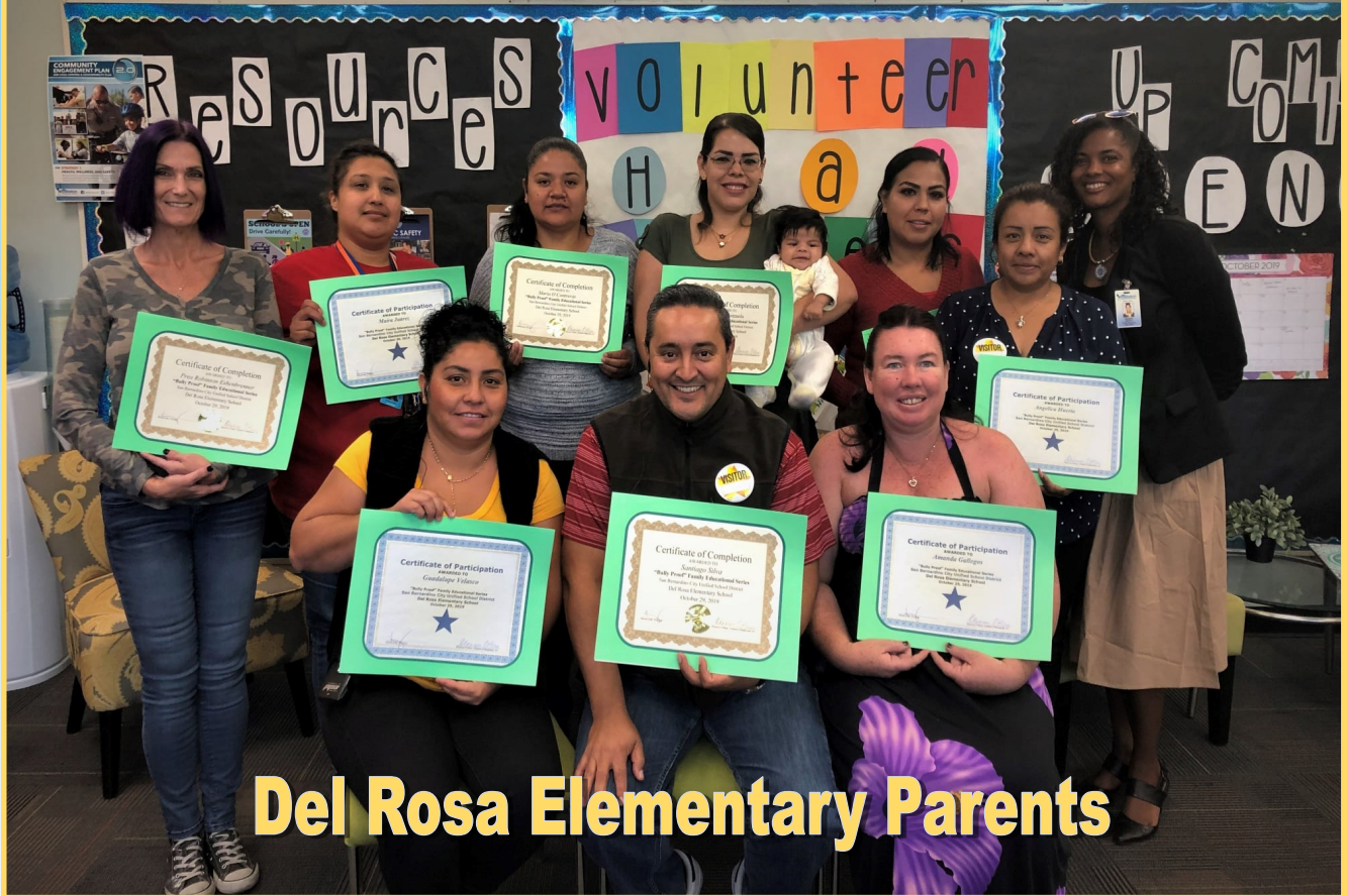
Del Rosa Elementary Parents